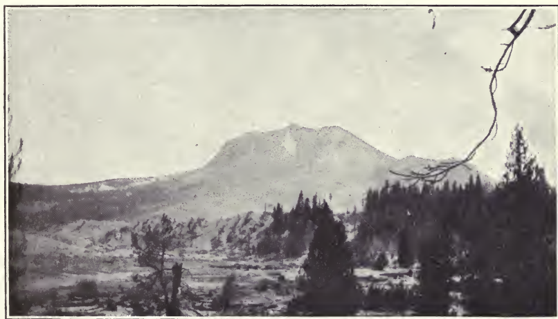
FIG. 6.—From the lower end of Jessen's Meadow, showing the once rich pastures converted into a waste of sand, gravel, and boulders. In the foreground are the logs of pines which once stood on the divide between Lost and Hat Creeks.

Fumaroles have developed at a number of points on the north and west slopes of Lassen Peak within 800 feet of the summit, but all the violent eruptions have occurred at or very near the summit. No fumaroles have appeared on the south and east slopes, the direction of easiest approach, where at lower levels, 5,800 to 7,400 feet, fumaroles and solfataras are such active features at Bumpass Hell, the Devils Kitchen, and Tartarus or Boiling Lake. These solfataras